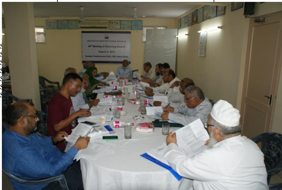
A view of the G.C. meeting

Programmes of the IOS was discussed in length and after deliberations it was unanimously resolved to hold only the Inaugural Session at New Delhi on November 05, 2016.