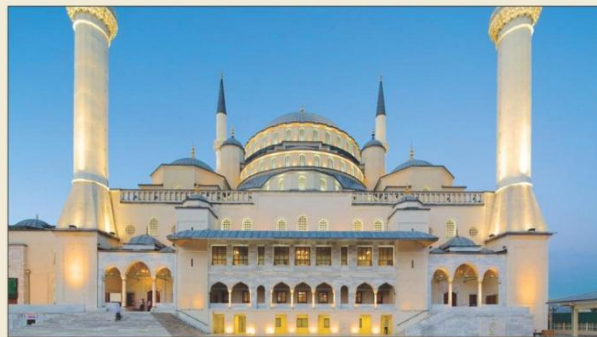
Kocatepe Camii (Mosque) – Ankara, Turkey, 1987

Idea of building the Kocatepe Mosque dates back to the 1940s. In 1956, through the efforts of the late Adnan Menderes, Prime Minister of the time, land was allocated for the project to build a mosque in Ankara, and a request for project was made once again in 1957. The accepted project was an innovative and modern design. This mosque, which can accommodate 24,000 worshippers, is one of the largest mosques of the world, and accepted by many as the frontiers of modern Islamic architecture. After a third architectural competition in 1967, a more conservative or nostalgic design by Hüseyin Tayla and M. Fatih Uluergün was chosen to be built. Completed in 1987, this project is built in a neo-classical Ottoman architectural style, and is an eclectic building inspired by the Selimiye mosque in Edirne, and the Şehzade and Sultan Ahmet mosques in Istanbul. https://www.expedia.in/Kocatepe-Mosque-Ankara.d617332.Attraction?rfr=TG.Destinations.POLExplore.1.4