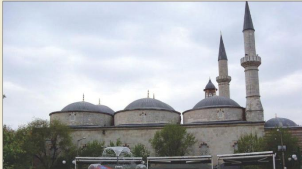
Eski Mosque, Edirne, Turkey, 1414

The first monumental construction was that of the Edirne Eski Mosque, which was started in 1403 by Emir Suleyman Celebi and was completed by Celebi Sultan Mehmed in the year 1414. The mosque is located in the historical center of the city. The mosque is covered by 9 domes supported on four columns. The mosque had originally a single minaret, the taller one was later built by Murat II. http://static.panoramio.com/photos/large/52578403.jpg