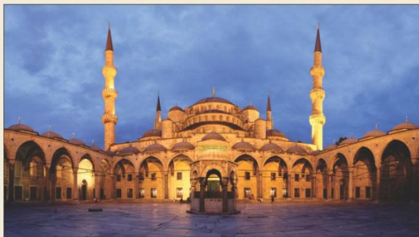
Sultan Ahmed Mosque or Sultan Ahmet Camii or Blue Mosque, Istanbul, Turkey, 1616

The Sultan Ahmed Mosque or Sultan Ahmet Mosque (Turkish: Sultan Ahmet Camii ) is a historic mosque in Istanbul. The mosque is popularly known as the Blue Mosque for the blue tiles adorning the walls of its interior. It was built from 1609 to 1616, during the rule of Ahmed I. Its Kiblaye contains a tomb of the founder, a madrasah and a hospice. The Sultan Ahmed Mosque is still popularly used as a mosque. https://en.wikipedia.org/wiki/Sultan_Ahmed_Mosque https://en.wikipedia.org/wiki/Ottoman_architecture#/media/File:Blue_Mosque_Courtyard_Dusk_Wikimedia_Commons.jpg